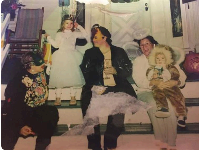
A Happy Halloween:)