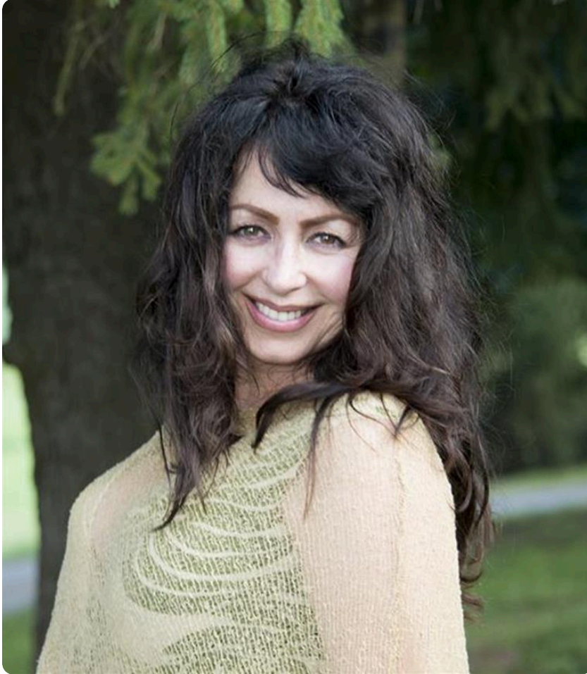
We Are so Sorry.